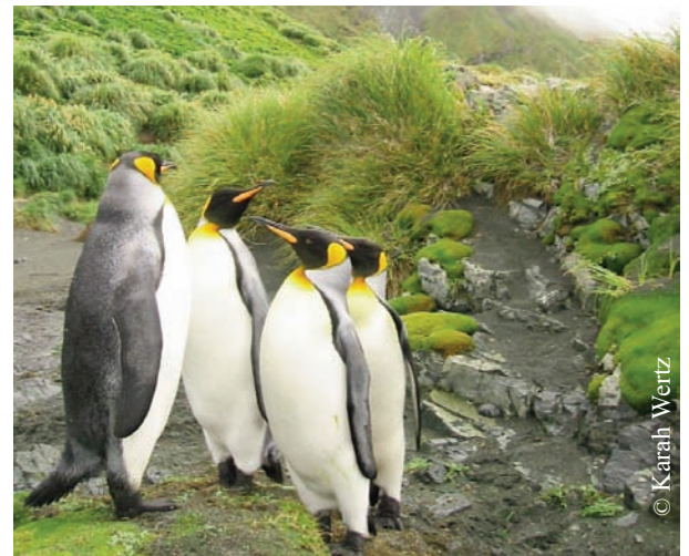
An unconfirmed number of king penguins were killed in a recent landslide on the island.

The island provides 'critical habitat' for two nationally threatened albatross species – the wandering and grey-